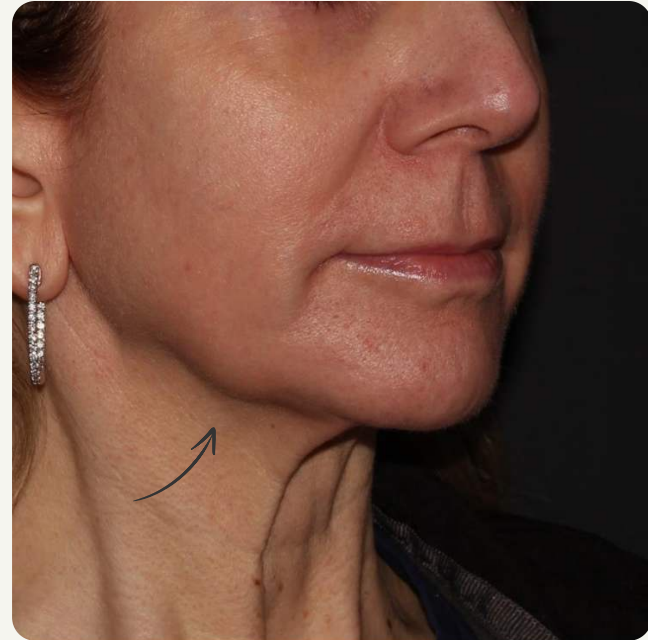
3 MONTHS AFTER 1ST TREATMENT

480-651-4989 | cosmetics@cleardermatology.net