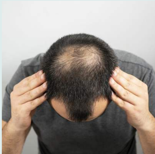
Male Pattern Baldness

Our team at InvestigateMD is conducting studies for the following conditions: