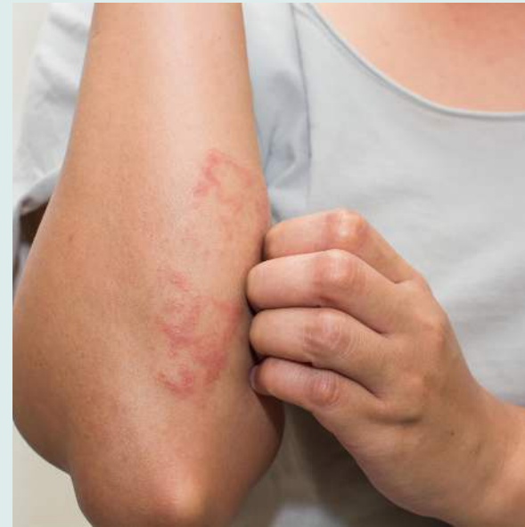
Atopic Dermatitis (Eczema)