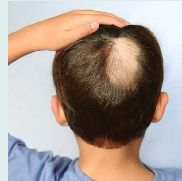
Alopecia Areata (Patchy hair loss)